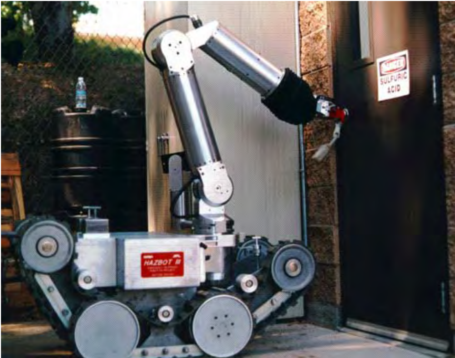
Figure 1. HAZBOT

surgeons could operate remotely on casualties without ever having to enter the combat zone (Cubano et al, 1999) .The engineers from NASA and the JPL also intended this concept for telesurgery in space to enable surgeons on earth to operate on astronauts at the space station. The time lag, however, prevented this from becoming feasible. The development of telerobotic technology was subsequently accelerated by various concomitant advancements in computer and surgical related technology. However, for a long time, placing dexterity enhancing robotic systems in the operating room remained an elusive goal. The further evolution of the robotic surgical system culminated in the development of a different skill and advanced instrumentation resulting in feasibility of the concept.