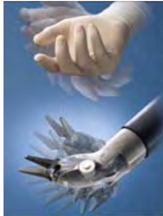
Figure 3. Endowrist

With the release of the da Vinci System ,Intuitive's major contributions to the history of robotic surgery is the 'EndoWrist', a miniaturized hand, and the control system, reproducing the range of motion and dexterity of the surgeon's hand, providing high precision, flexibility and the ability to rotate instruments 360 degrees through tiny surgical incisions(Robotic Surgery,2005)(Figure-3). Later seven degrees of freedom were added which offered considerable choice in rotation and pivoting (Camarillo et al, 2004). The da Vinci Surgical System replicates the surgeon's movements in real time. It cannot be programmed, nor can it make decisions on its own to move in any way or perform any type of surgical maneuver.